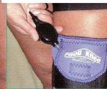
AIR INFLATION SYSTEM